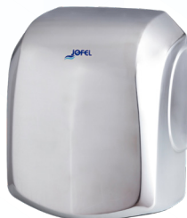
AA18000 8427950340215 Polished finish