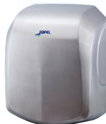
AA18500 8427950340246 Satin finish