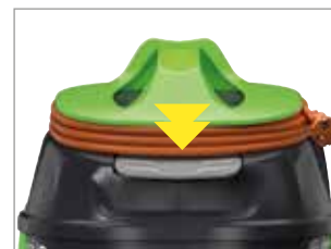
CONVENIENT FOOT PEDAL FOR MOTOR POWER ON