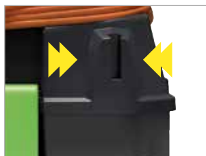
INTUITIVE PARKING SLOT FOR FLOOR NOZZLE