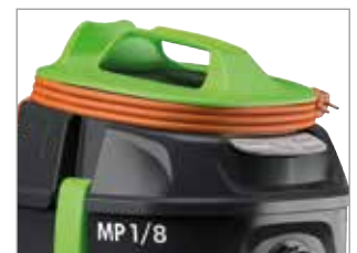
HIGH-VISIBILITY POWERCORD EASY TO WRAP